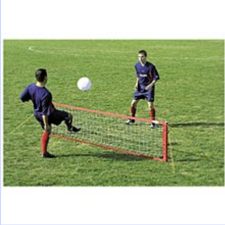
Kwik Goal Over The Net Soccer Training Game

(I have so much stuff that they must think I'm a "bloody" genius..... ha ha!)